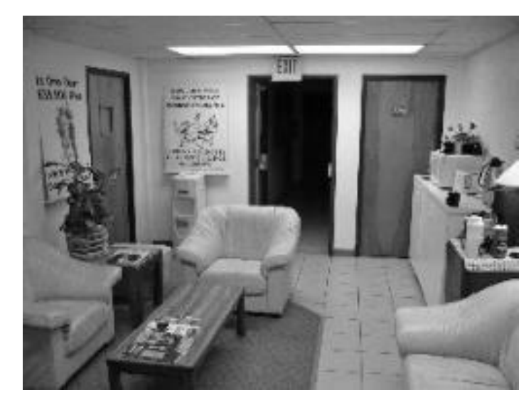
NCFM Galley/Lounge Area