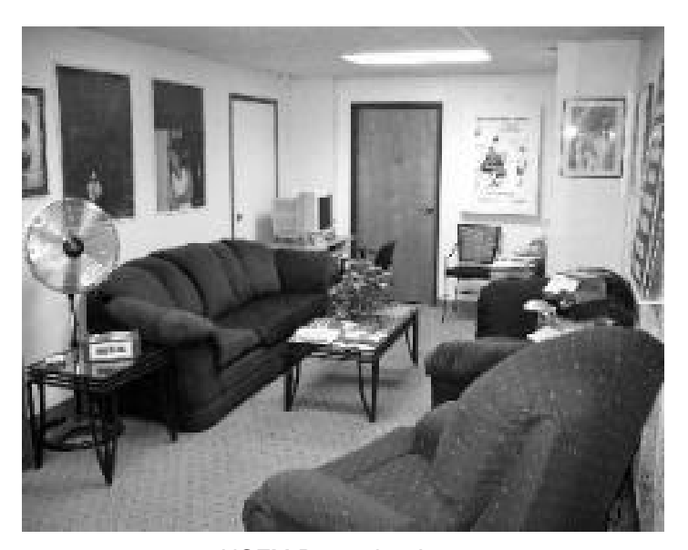
NCFM Reception Area